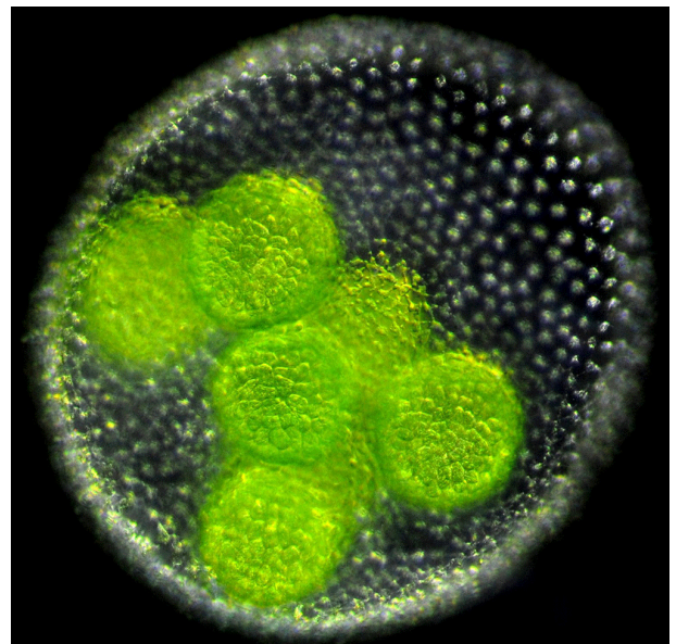
FIG. 1: Photograph of an adult Volvox . The small green spheres are embryos. (S. Höhn et al. [5])

This stunning process of inversion varies from species to species [7]. In V. globator , one half of the spherical sheet of cells shrinks in radius and invaginates, initiating